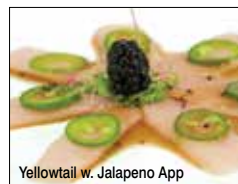
Yellowtail w. Jalapeno App