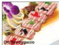
Chu Toro Carpaccio