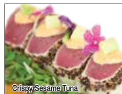
Crispy Sesame Tuna

If you have a food allergy, please speak to the owner, manager, chef or your server