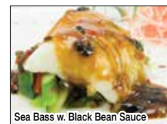
Sea Bass w. Black Bean Sauce

Designed & Printed by Sanford Printing, Inc. Copyright © 09/16 第一印刷公司 718-461-1202