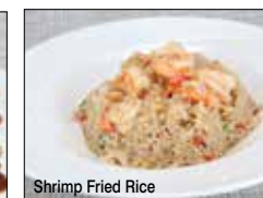
Shrimp Fried Rice