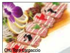
Chu Toro Carpaccio