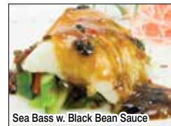
Sea Bass w. Black Bean Sauce

Designed & Printed by Sonford Printing, Inc. Copyright © 09/16 第一印刷公司 718-461-1202