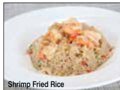
Shrimp Fried Rice