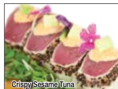
Crispy Sesame Tuna

If you have a food allergy, please speak to the owner, manager, chef or your server