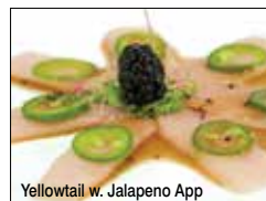
Yellowtail w. Jalapeno App